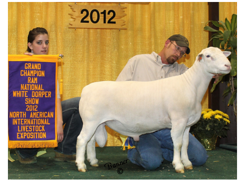
Grand Champion Ram 2012 NAILE.

Super nice RR yearling ewe. Not the biggest but conformation wise you can't make one better. Super feminine fronted, moves like a cat. Straight topped, big rib cage, wide hip, with lower leg. Just one cool little female.