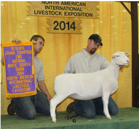
RF 6099 – Reserve Champion Ewe 2014 NAILE. She sells as Lot 142!