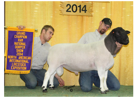
RF 5938 - Grand Champion Ram 2014 NAILE. Sire of Lots 25 & 26.

This girl has a large Black Patch on her hind leg. Another 6235 daughter that did a great job raising her fall buck lamb. The old 1096 ewe has a little genetic power behind her! Mother of Lot 10. Exposed to 6799.