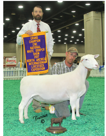
RF 6445 - Grand Champion Ewe 2017 NAILE, Supreme Ewe at 2017 Big E. This stud ewe sells as Lot 150!

A female making machine five of her six daughters sell! She has lambed in the fall, however, the last two years she lambed in the spring. After weaning her lambs this spring she bottle jawed, we do have her straightened out. Dam of Lots 177, 193, 194, 210, 211.