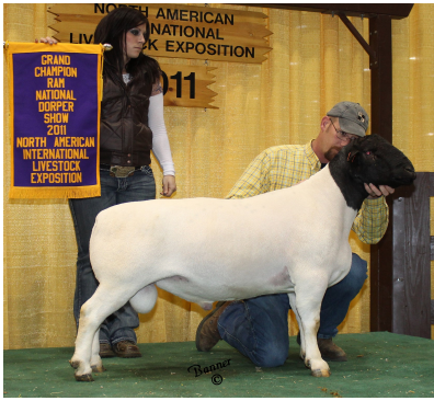
RF 5482 Champion Ram 2011 NAILE. A daughter sells as Lot 23.