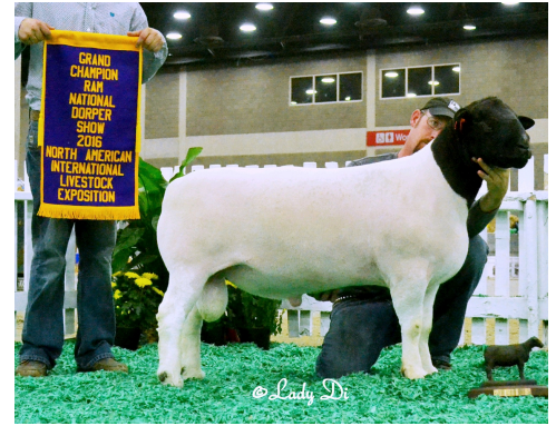
RF 6235 - Grand Champion Ram 2016 NAILE. Sire of Lot 2 and others in the Sale!