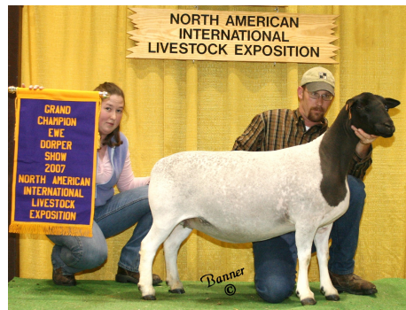
Grand Champion Ewe 2007 NAILE. These winning genetics sell on May 29!

We used frozen semen from 4473 to flush 6905 (Lot 48). Not the best idea but we received one very good ewe lamb. Champion Genetics here! The 4473 daughters are great brood ewes. Dam is Lot 48.