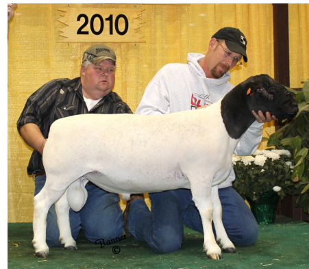
Grand Champion Ram 2010 NAILE. Breed building genetics will sell at the Riverwood Farms Dispersal sale on May 29.