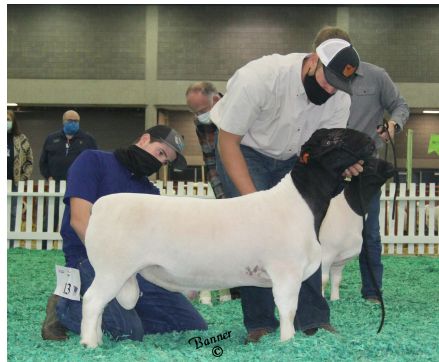
RF 6945 - Grand Champion Ram 2020 NAILE. He sells as Lot 5!

Champion Ram 2020 NAILE. What a ram!! Ewes sell exposed to him for fall lambs. Sired by Lot 1 and dammed by a super ewe 6395 lot 31. 6395 dammed our Reserve Champion Ewe at the 2019 NAILE. 6945 is the best son of 854, he is long, big, good headed and muscular. He traces back to our best genetics 5150, 4930, 4465, Powell Ranch 4473 and the legendary female 4415.