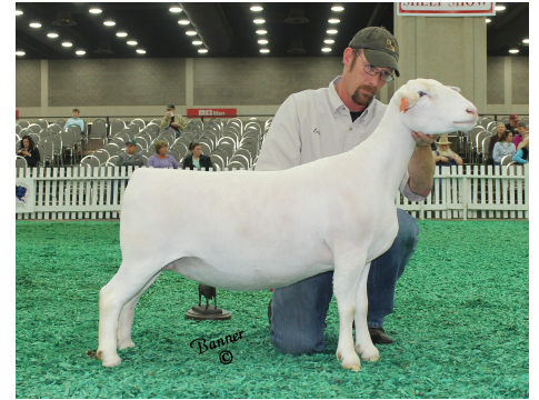
Grand Champion Ewe 2015 NAILE. This is your opportunity to add genetics like this to your program.

Maternal sister to 6837 Lot 124. This 6541 was our best fall lamb of 2017 even as an October. She is double bred Bone Crusher. She aborted this spring. Exposed to 7005.