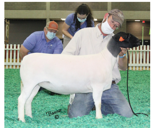
RF 6933 - Champion Dorper Ewe 2020 NAILE. SHE SELLS AS LOT 69!

These yearling ewes are a flat incredible group. Super uniform, feminine fronted, long bodied with thickness. Some are better than others, but from top to bottom they are very similar.