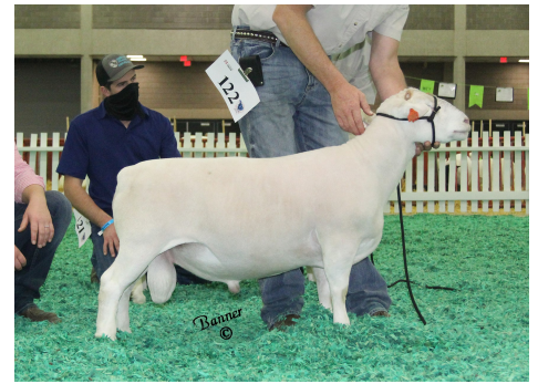
RF 6981 – Reserve Champion White Dorper Ram 2020 NAILE. He sells as Lot 127!

VIEW THE SALE & BID LIVE ONLINE AT: breedersworld.com