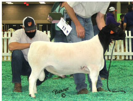
RF 6799 - Reserve Champion Dorper Ram 2020 NAILE. He sells as Lot 2!

Last July Big Jim told me to get 20 more Dorper Ewes. 9453 was exposed when we purchased her and the result is 7142. He is a complete outcross. We have called him "Beefy" since birth. Top mass, big hip, massive lower leg. We were going to use him in our program. Our loss is your gain.