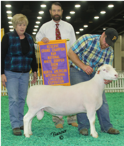
Reserve Champion Ram 2017 NAILE.